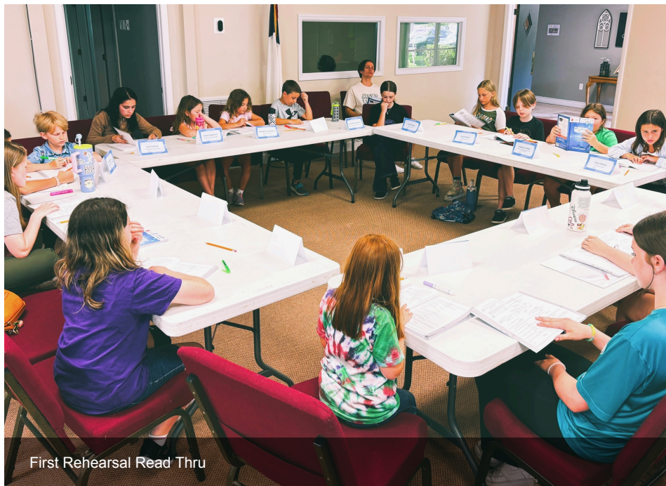
First Rehearsal Read Thru