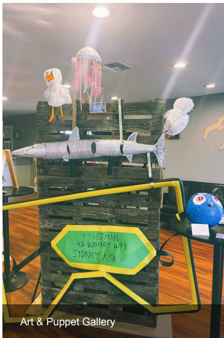
Art & Puppet Gallery